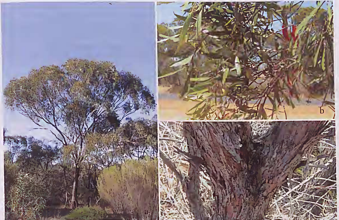
Figure 6: Eucalyptus wimmerensis subsp. grata , W of Diapur. a. tree; b. branchlet; c. basal bark.

Distribution and habitat: Eucalyptus wimmerensis subsp. grata is known from a few locations in the north-western Wimmera in the Lawloit Range, namely west of